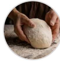
HOME MADE IN OUR WORKSHOP