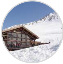
17 MOUNTAIN RESTAURANTS