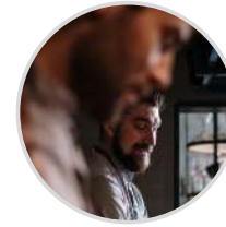
PASSIONATE COLLABORATORS RESPECTFUL OF THEIR LAND